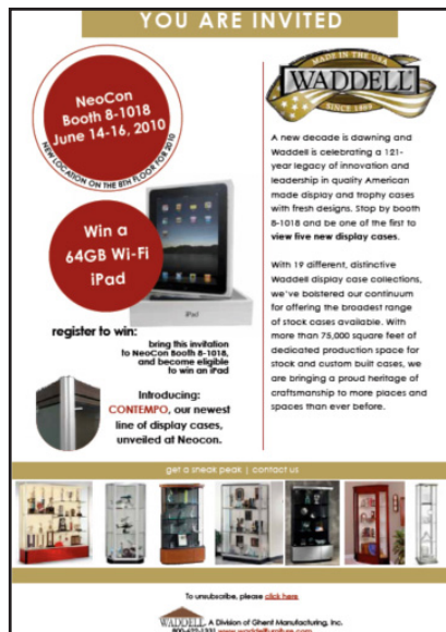
▲ WADDELL FURNITURE - EVENT E-MAILER