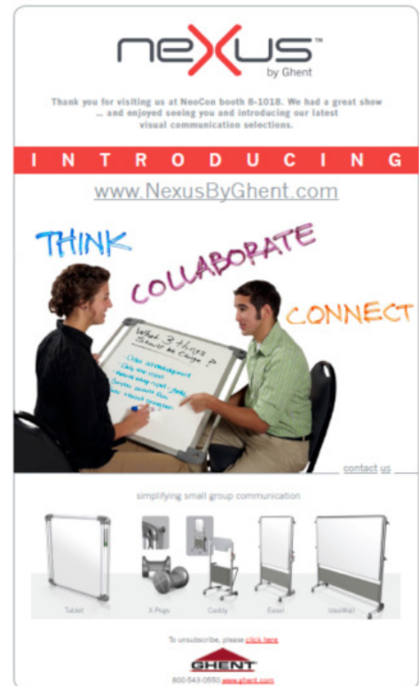
▲ GHENT VISUAL COMMUNICATIONS - TRADE SHOW E-MAILER