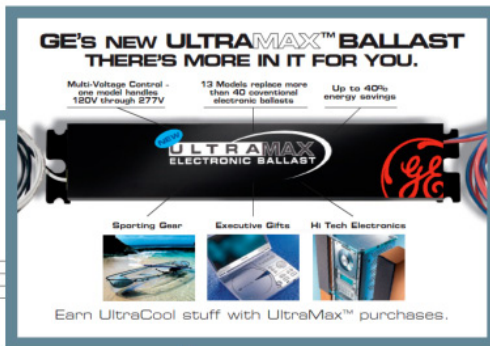
▲ GE LIGHTING TRANSFORMING THE POWER OF LIGHT - CAMPAIGN MAILER