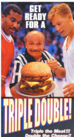
▲ PIERRE PRODUCT INTRODUCTION