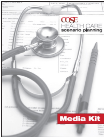
▲ COSE SCENARIO PLANNING AUTOLOAD CD PRESENTATION AND REFERENCE GUIDE

Driving sales with a meaningful message, artfully told